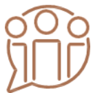
MEMBERSHIP & CERTIFICATION

Organisations are lifting the bar on delivering projects on time and on budget, particularly in competitive and fast-moving markets where achievement needs to happen more, faster, and for less. This has elevated the role of project managers and increased their importance in strategy setting and the execution of organisational objectives.